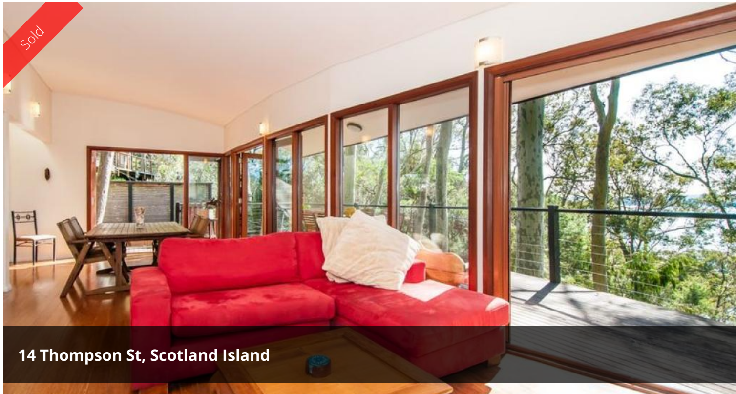
14 Thompson St, Scotland Island