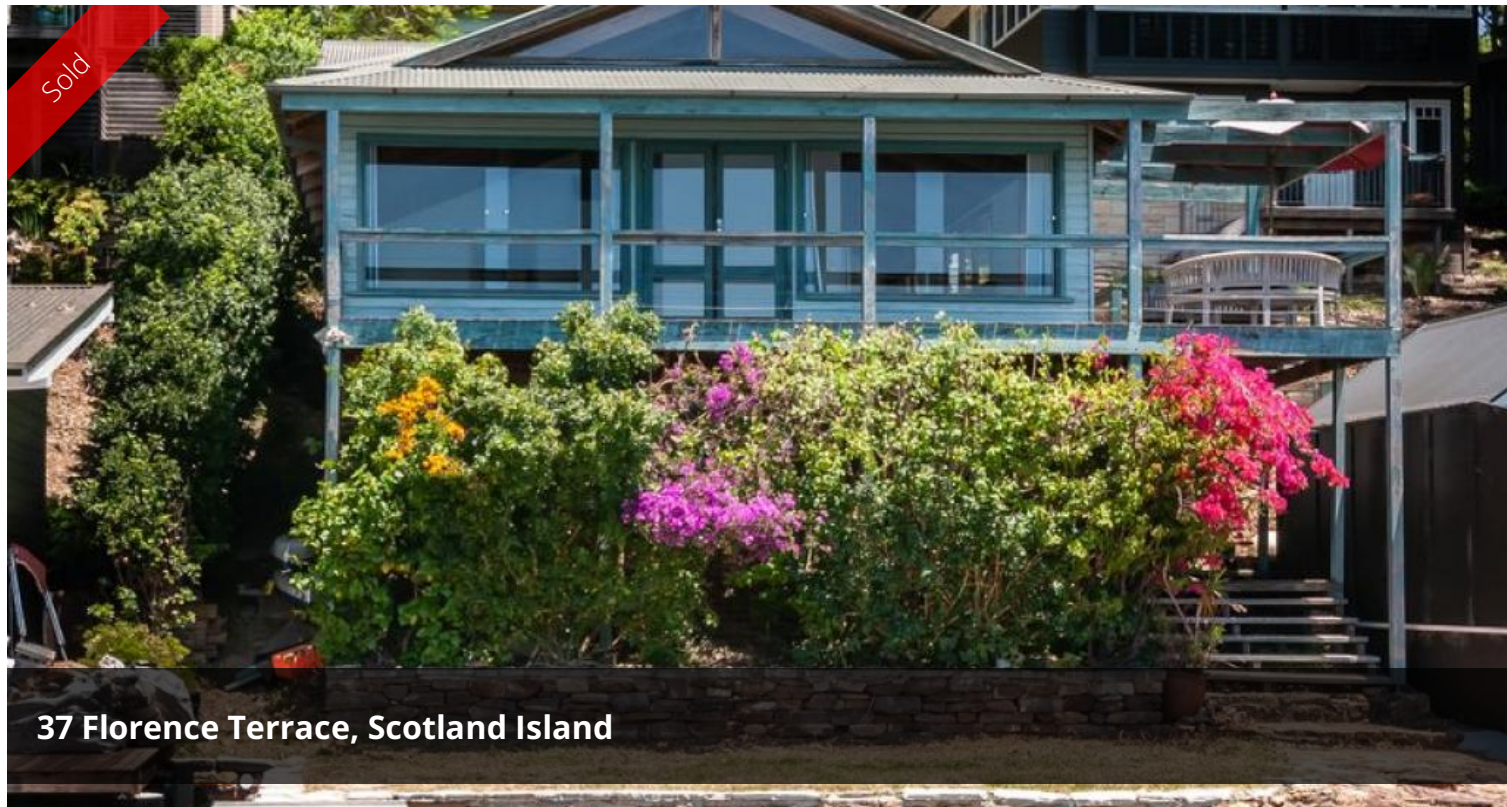
37 Florence Terrace, Scotland Island