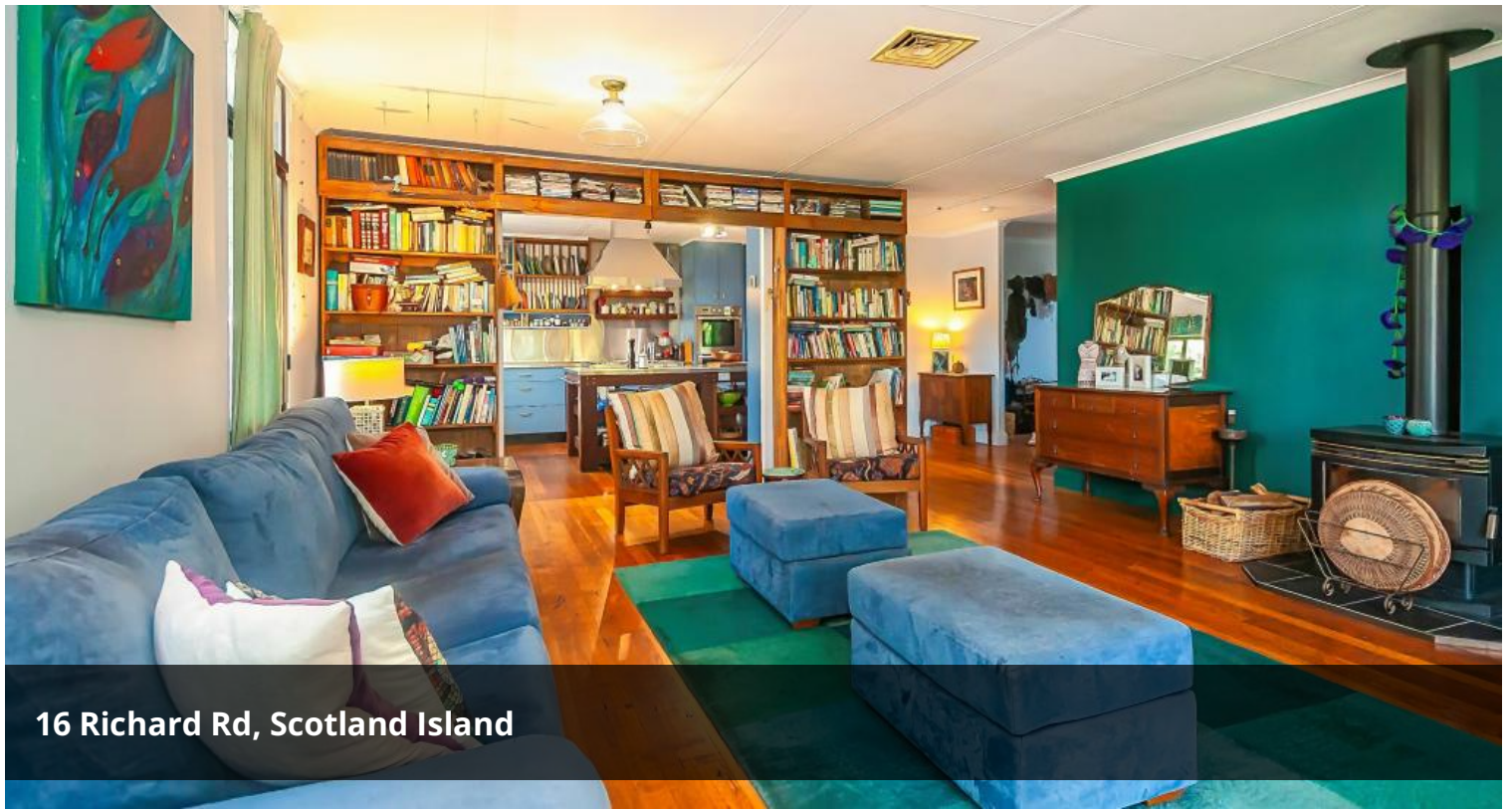
16 Richard Rd, Scotland Island